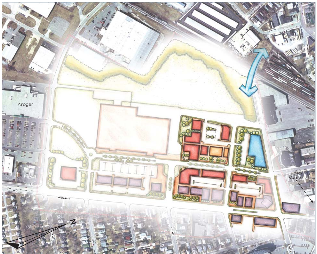
Figure 4.8.4: Latonia Plaza Conceptual Rendering Phase Two

It is during this phase and/or the long-term phase that existing users of out lots such as McDonald's and US Bank could be encouraged to move to the Latonia Centre. In earlier phases as the transition begins the conceptual redevelopment plans show these uses still in place. One likely way these will relocate might be when existing structures need replacement or major remodeling to remain functional is necessary for the intended uses.