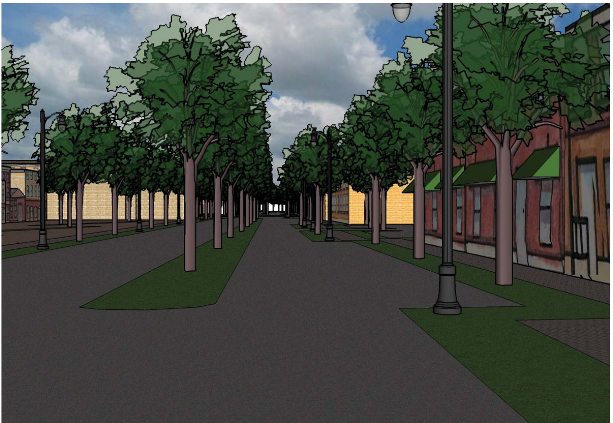
Figure 4.8.12: Latonia Plaza Potential 3D Rendering - Primary Parallel Roadway