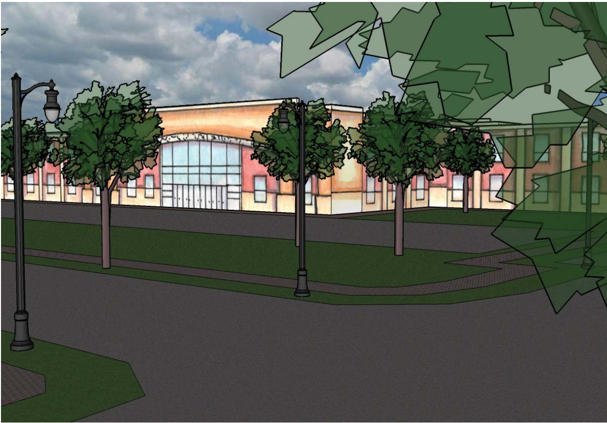
Figure 4.8.13: Latonia Plaza Potential 3D Rendering - Community Facility