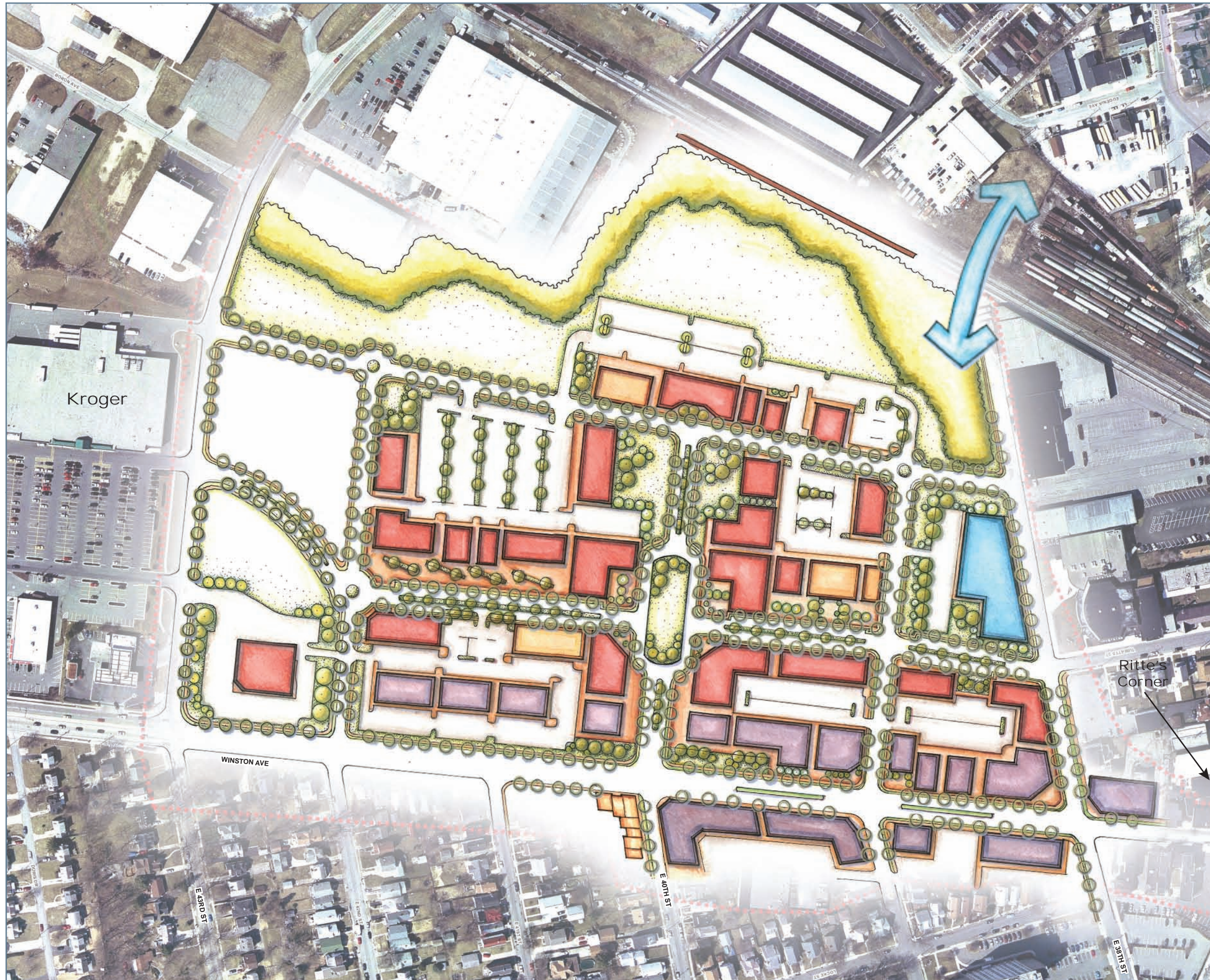
Figure 4.8.6 Latonia Plaza Redevelopment Conceptual Rendering Final