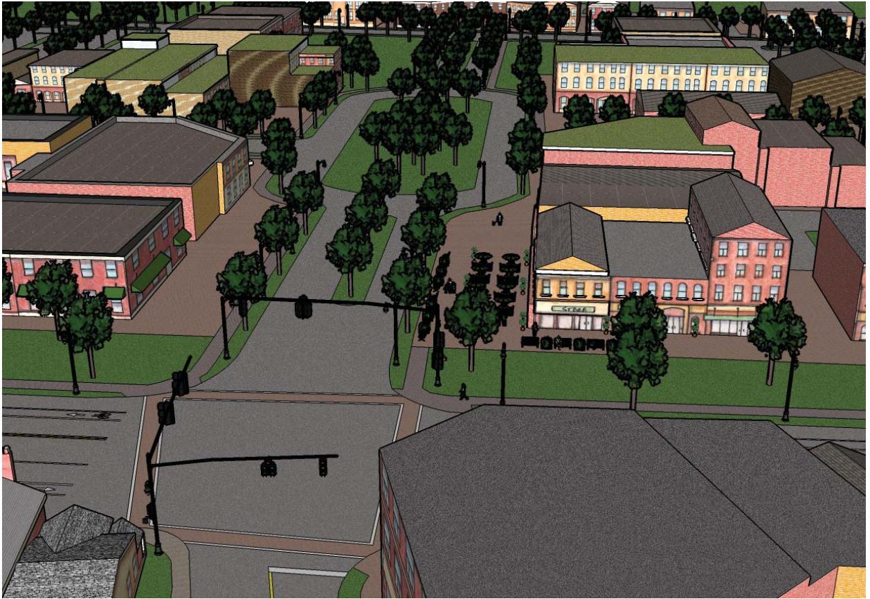
Figure 4.8.11: Latonia Plaza Potential 3D Rendering - Looking West at 40th Street