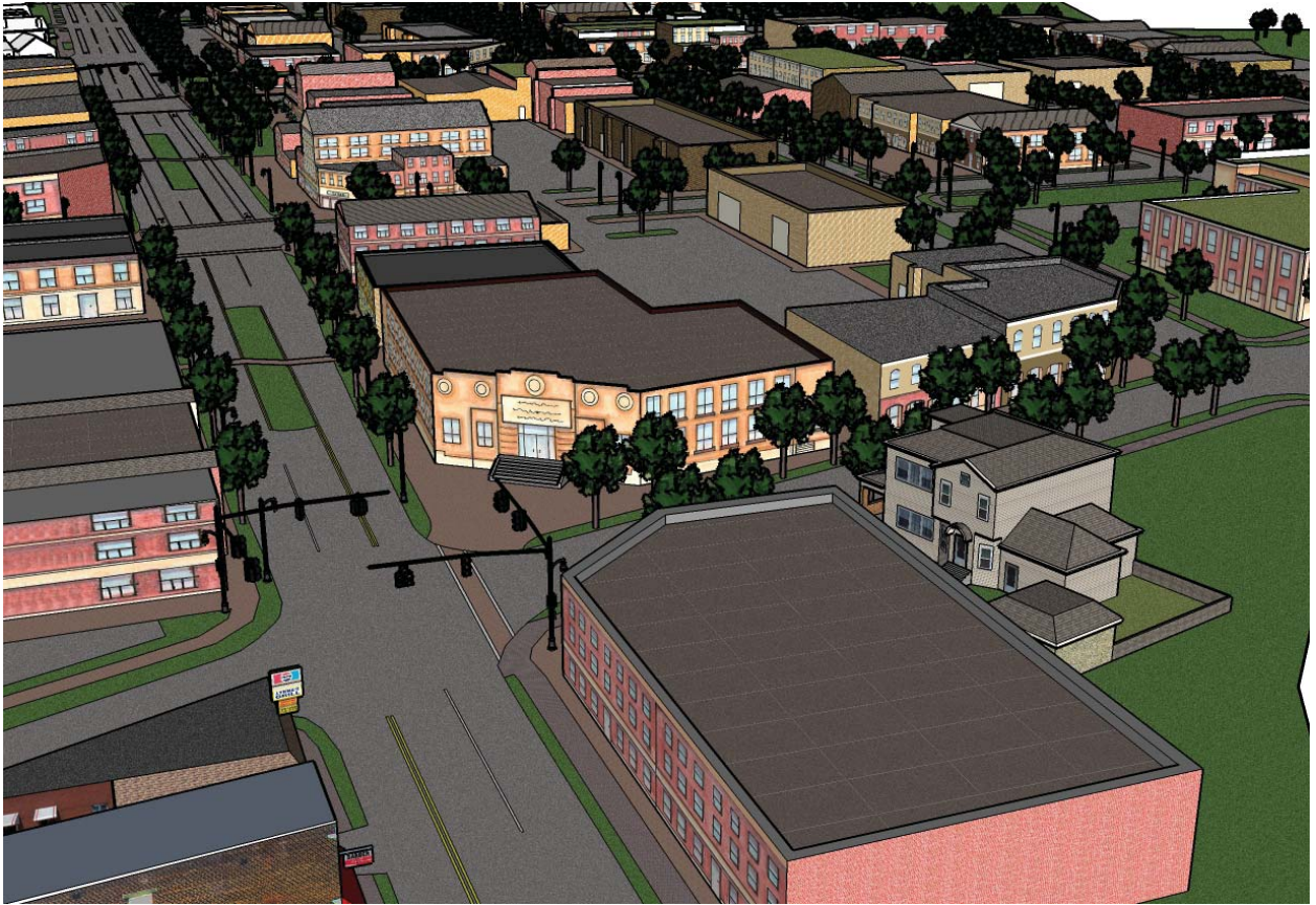
Figure 4.8.7: Latonia Plaza Potential 3D Rendering - Looking South on Winston Avenue