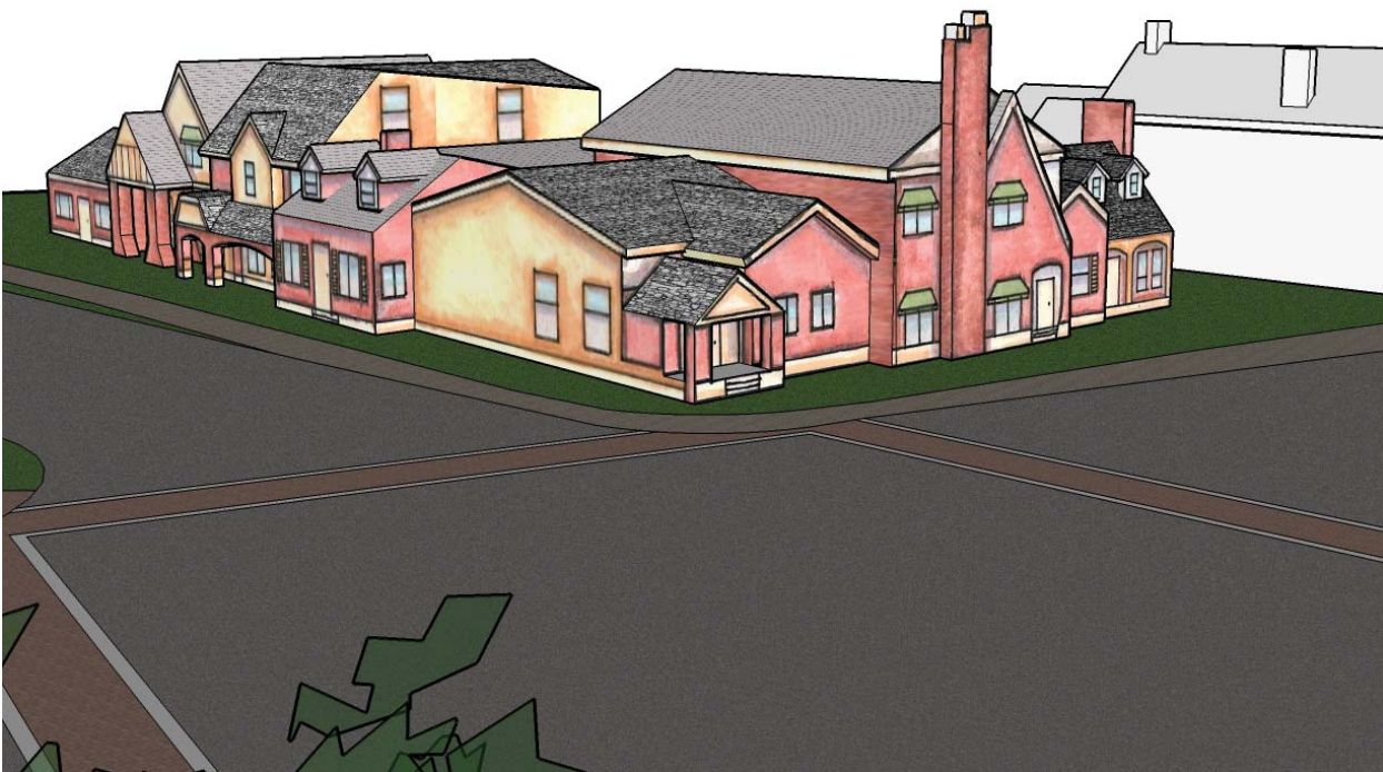
Figure 4.8.14: Latonia Plaza Potential 3D Rendering - Single Family Attached Residential