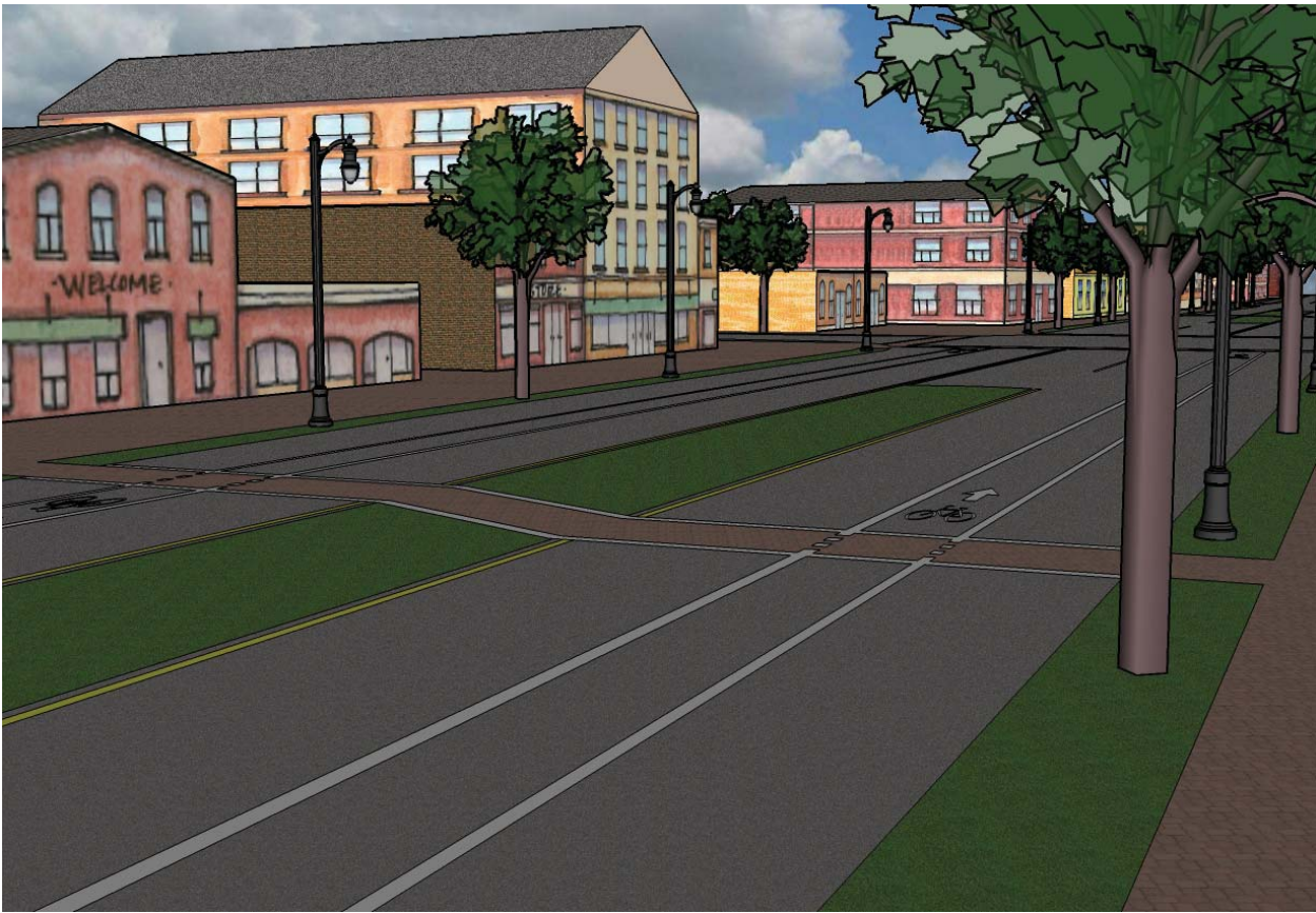
Figure 4.8.9: Latonia Plaza Potential 3D Rendering -Looking North on Winston Avenue