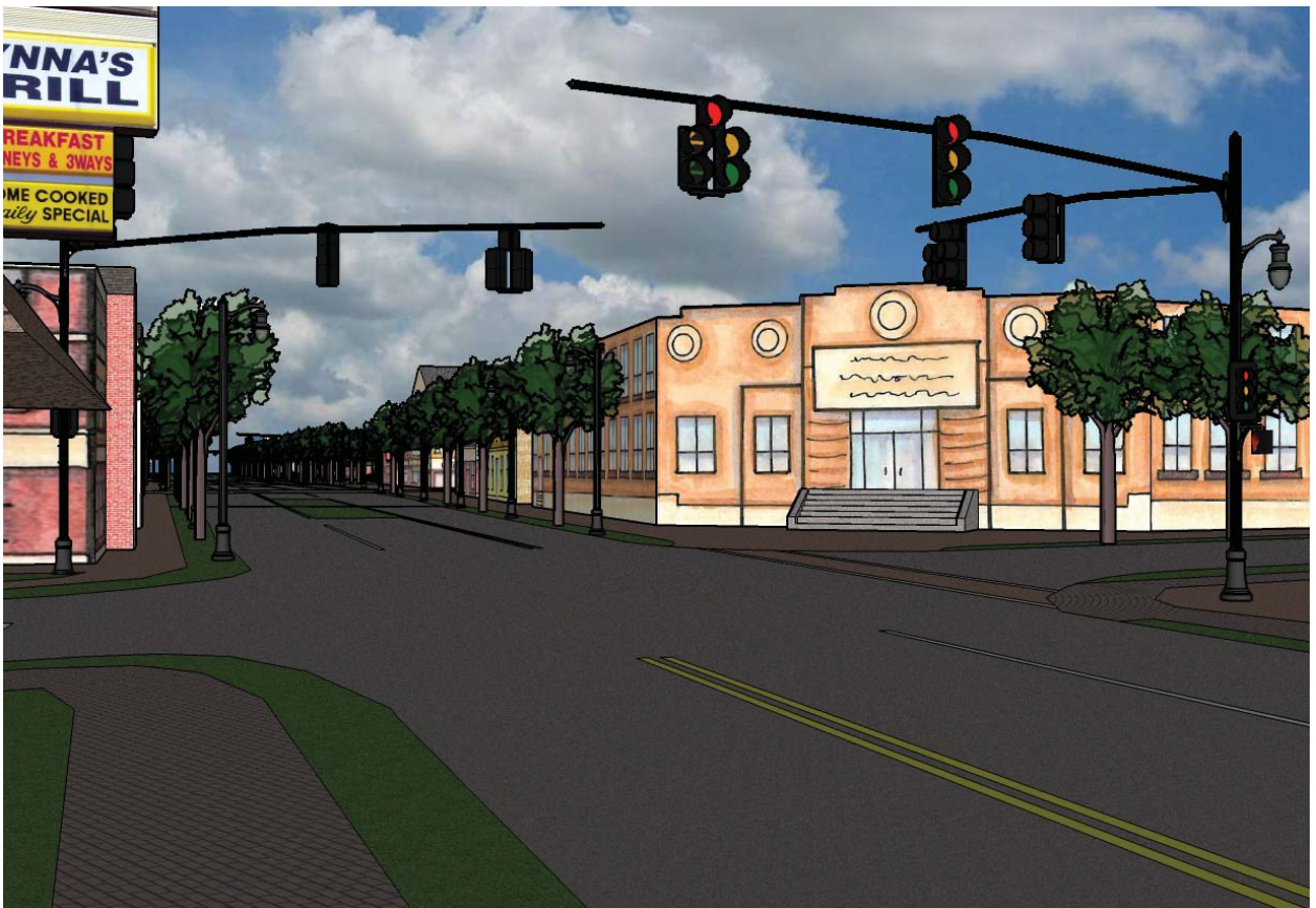
Figure 4.8.8: Latonia Plaza Potential 3D Rendering - Looking South on Winston Avenue