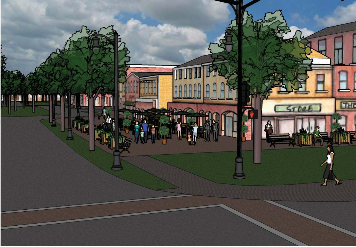
Figure 4.8.10: Latonia Plaza Potential 3D Rendering - 40th Street and Winston Avenue