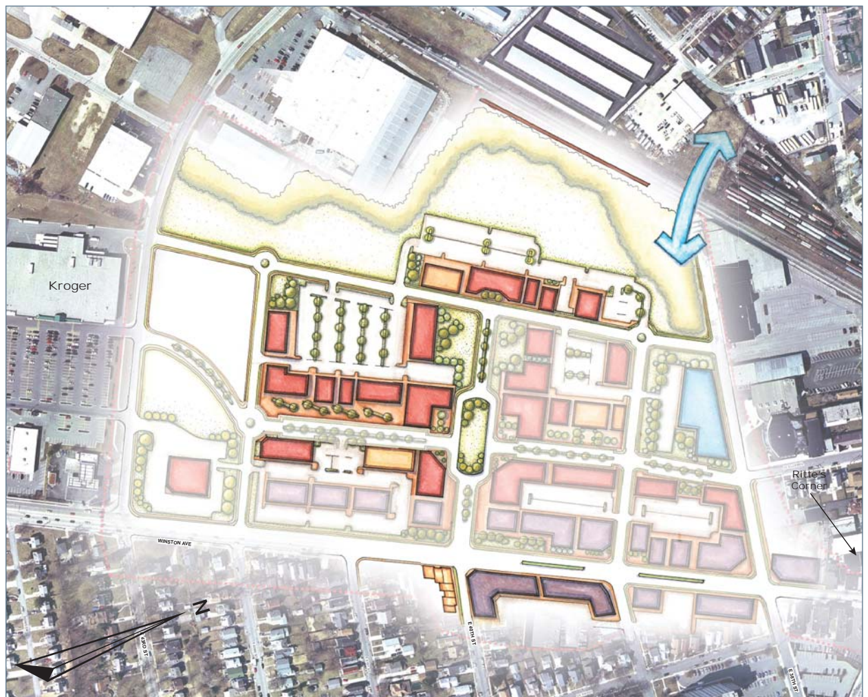
Figure 4.8.5: Latonia Plaza Conceptual Rendering Phase Three

The final phase of this redevelopment rendering also depicts the roundabout in its complete form. This roundabout is designed to be added through steps included in each phase and finalized in phase three of the redevelopment rendering. An additional section of non-traversable median between 39th and 40th Street should be implemented as curb cuts are closed on this block during reconstruction. This median will work towards increasing pedestrian mobility