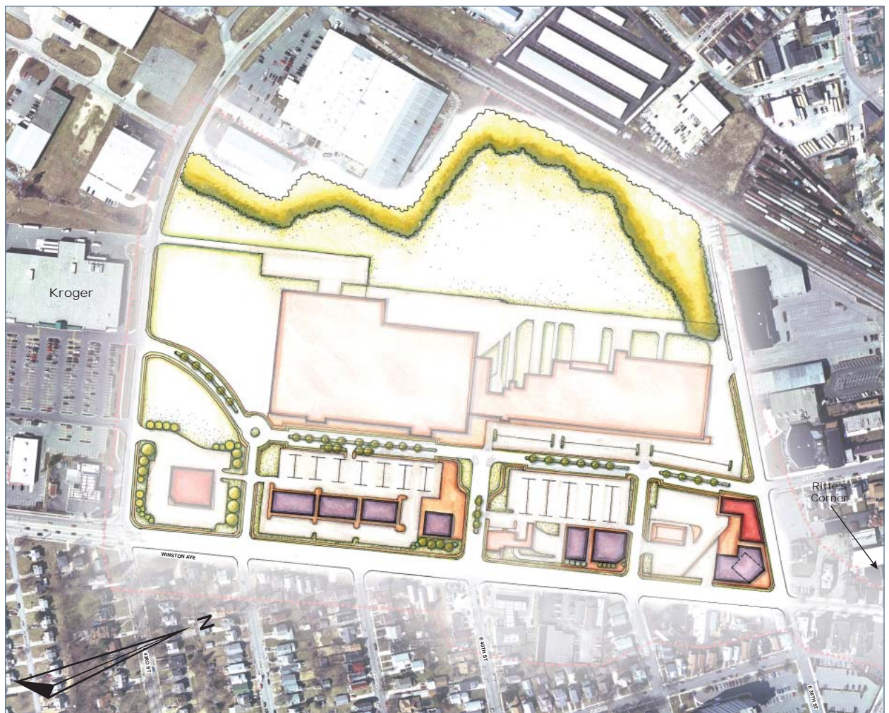
Figure 4.8.2: Latonia Plaza Conceptual Rendering Phase One

A primary goal of this redevelopment rendering is to tie together the character of Ritte's Corner with the existing neighborhood and carry it into redevelopment that occurs. Constructing new buildings that are set closer to Winston Avenue will help move toward a more cohesive character for the entire area by working toward the idea of tying into the character of the neighborhood. Efforts should be made to pick up characteristics of existing buildings in Ritte's Corner and take them further into the Latonia community, specifically into the redevelopment area.