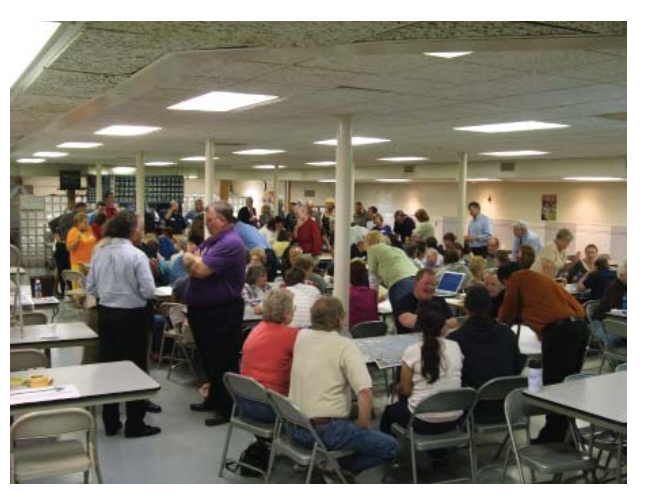
Figure 1.0.1: Public Meeting One held at the Holy Cross High School Cafeteria, April 29, 2010

Public meetings are a vital component of public involvement. These meetings give staff and the Task Force an opportunity to directly interact with the public in an effort to gain their thoughts and aspirations about the future of the neighborhood. Two public meetings were held during the planning phase of the study. The first meeting was held on April 29, 2010, in the cafeteria of Holy Cross High School (See Figure 1.2). Over 120 people attended this meeting where they participated in small group discussions to present ideas and information