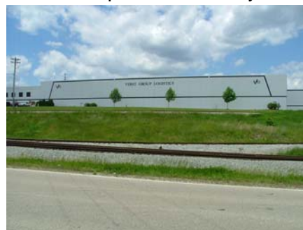
Industrial development in Boone County

The intent of the study is to identify and reserve land for future light industrial uses. The study will identify areas appropriate for this form of development where it is least intrusive to existing residential development.