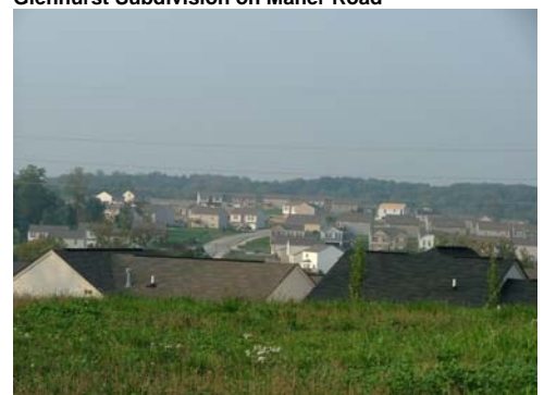
Glenhurst Subdivision on Maher Road

The intent of the study is to identify appropriate areas and types of residential development to serve the growth that will occur in the community in the next 25 years. Guidelines for residential development that will require developments to be built in harmony with the existing natural environment are also included in the study.