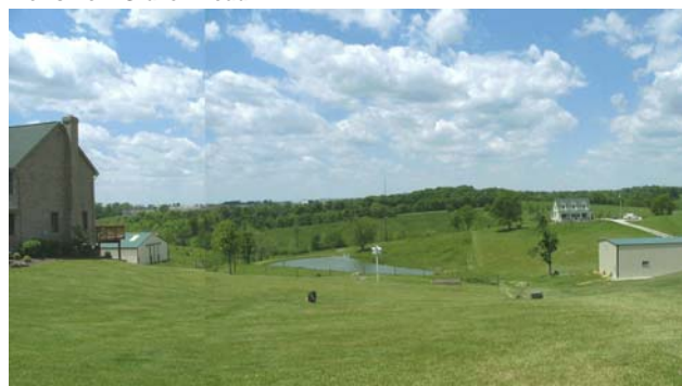
Views from Graven Road

The intent of the study is to protect hillsides and existing woodlands while allowing for development. Existing woodlands, which are located mostly on hillsides, should be protected and/or enhanced to the extent possible to serve as buffers within the viewsheds.