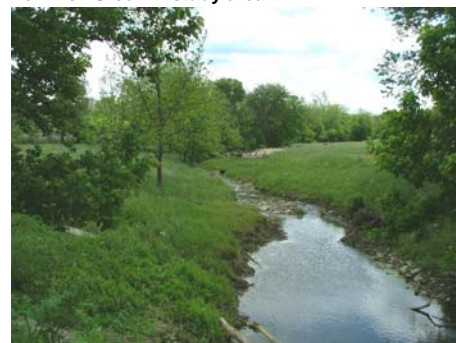
Banklick Creek in study area

The intent of the study is to identify areas for preservation and protection that will enhance and protect the quality of the Banklick Creek and its tributaries while protecting the rights of property owners to develop their property when they choose to do so.